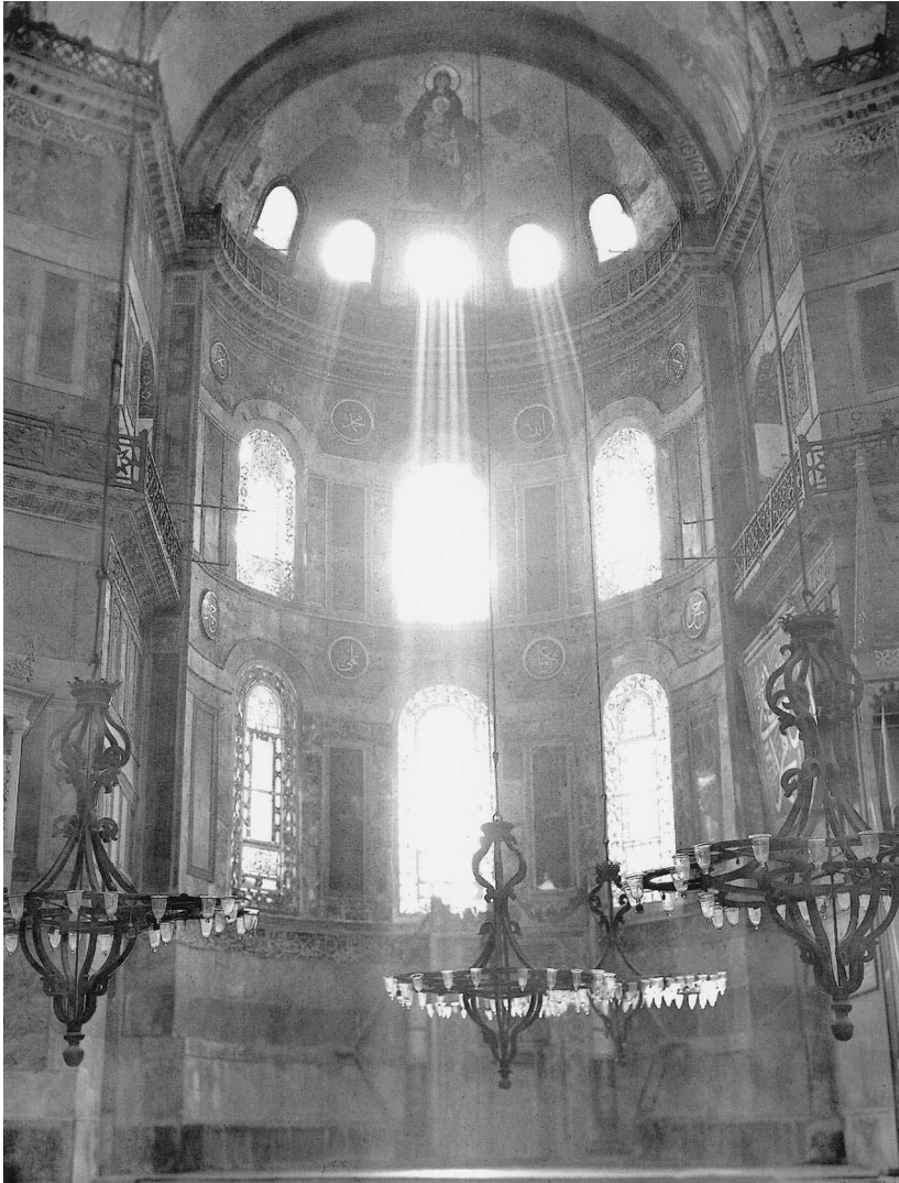
FIGURE 4.1. Morning light in Hagia Sophia, Constantinople. (Dumbarton Oaks, Byzantine Fieldwork Archives, Washington, DC.)

is a proof of apatheia , when the intellect begins to see its own light, and remains calm during the visions of sleep, and can look at things with serenity. 72 But beyond this awareness of its own light, which I think means something like an awareness of its own powers of contemplation, there lies the encounter with God himself, which much of the tradition of Byzantine monasticism, and